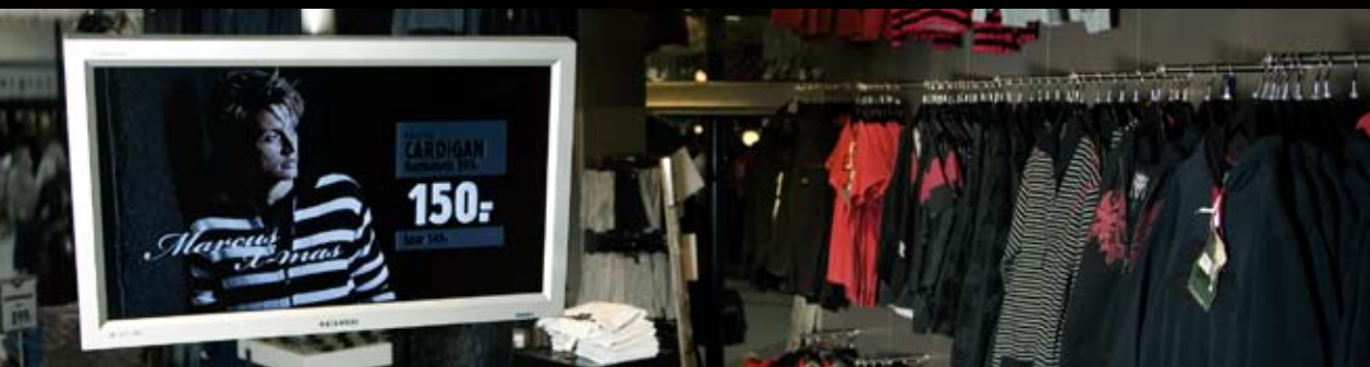
An in-store TV and radio solution for the company Marcus' (men's wear) shops in Denmark. The Sound of Marcus - own radio channel with commercial inserts and music.