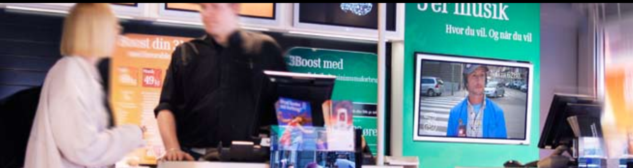
Development and installation of a complete in-store TV solution in 30 Danish 3-Shops (telecom).