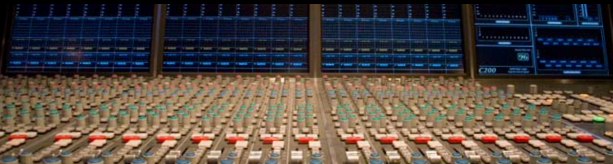
Complete system integration of the new concert hall for DR in DR-BYEN in Ørestaden, Copenhagen (The Danish Broadcasting Corporation)