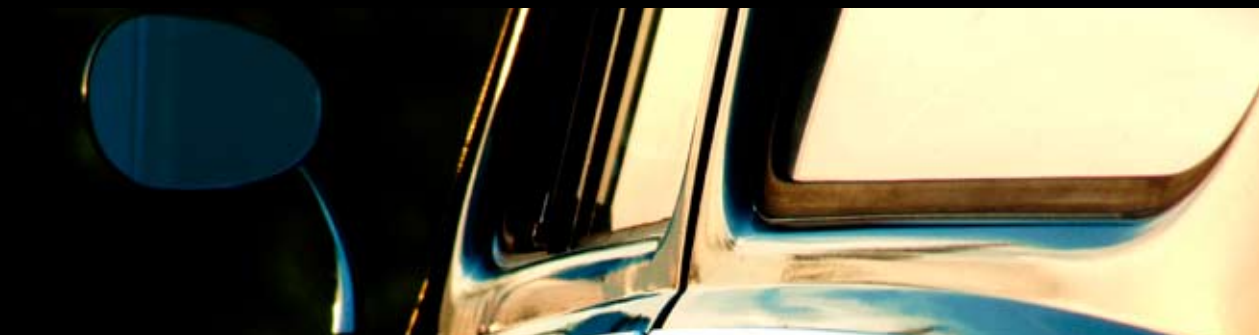
AM3D delivers Sound Enhancement for the car manufacturing industry and cooperate with some of the largest manufactures within the industry.