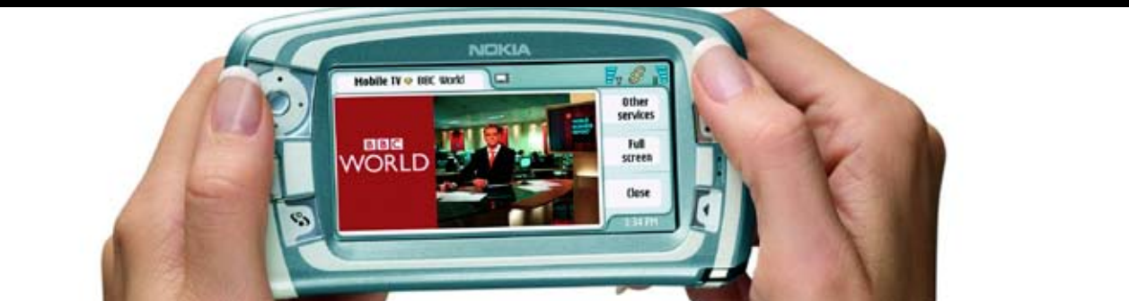
Mobile TV: AM Innovation has worked with mobile units and technologies within communication for a number of years and is currently working with handheld digital TV units.