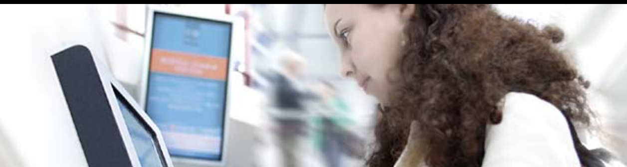
Complete information solution for Faculty of Arts at the University of Aalborg including big screen TVs, web and mobile access and information points placed in seven different locations on campus.