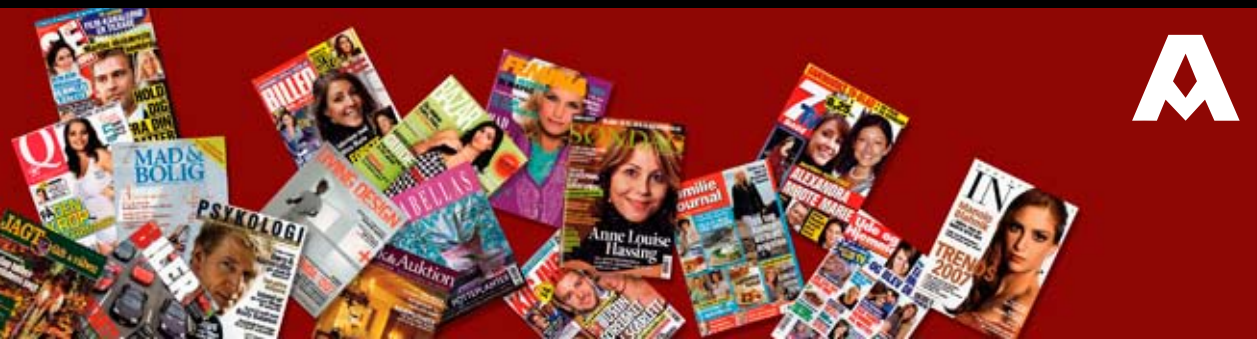
Aller International (publisher of magazines): Implementation of a Citrix solution.