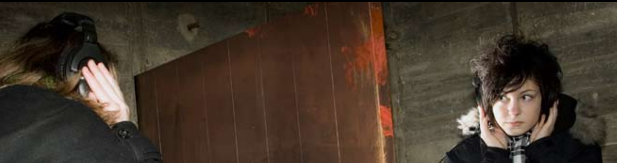
Installation of a 3D audio/visualization of a WW2 Gestapo interrogation at Bangsbo Fort (The Bangsbo Museum).