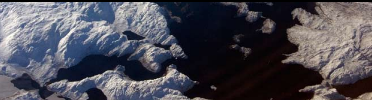
Complete digital solution at KNR (national radio and TV station in Greenland)