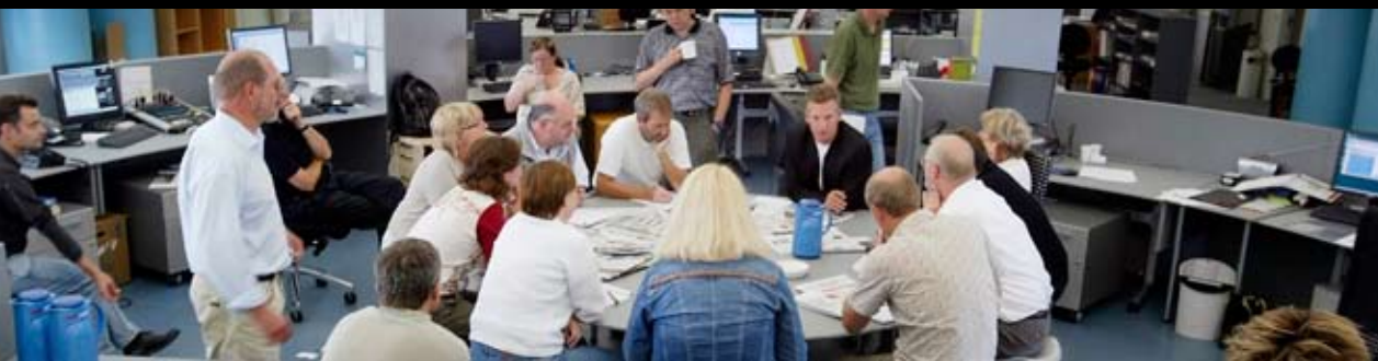
Nordjyske Medier (TV, radio, newspapers etc.): Design and maintenance of work stations, servers, network and optimizing of the information work flow.