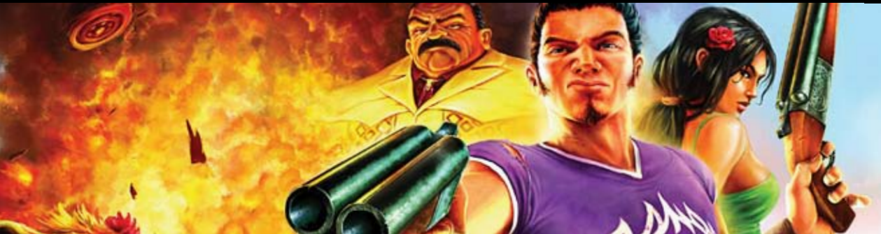
Deadline Games has integrated 3D Audio in the computer game Total Overdose, which gives the user a true three-dimensional sound experience.