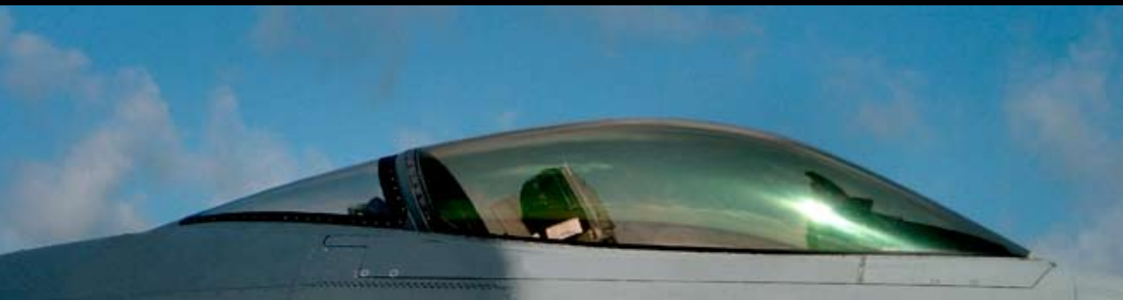
3D Audio is implemented in the F16 fighter jets from the Royal Danish Air Force, which reduces the pilot's response time during flying.