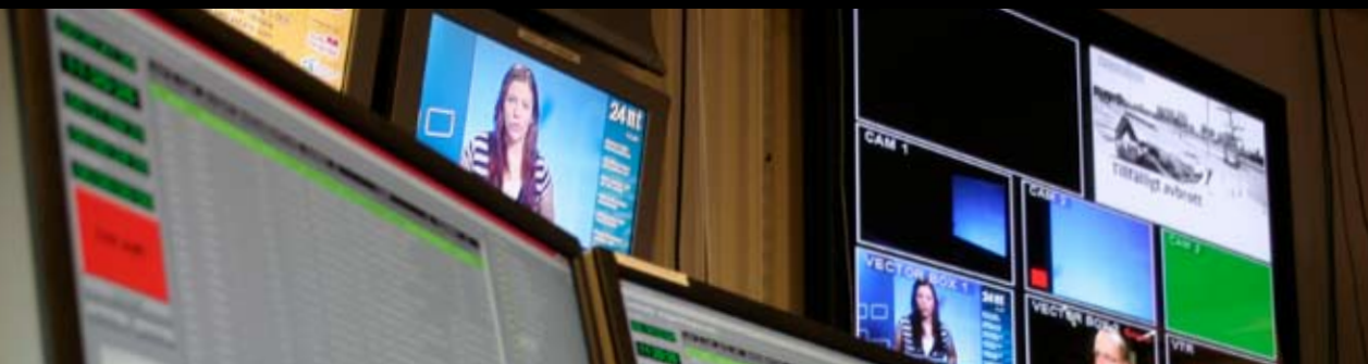
Implementation of an automatic play-out-system for the Swedish 24-hours news channel 24NT.