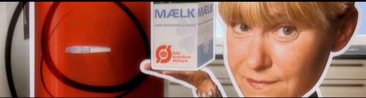
Development of graphic identity to DR's (The Danish Broadcasting Corporation) life style TV show "Kender du typen".