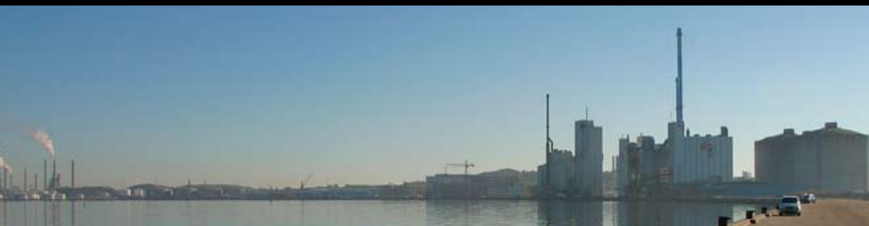
Port of Aalborg Ltd.: Complete outsourcing of servers, work stations and network, help desk and level two support.