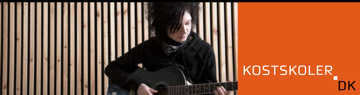
Cost and benefit: campaign, graphic identity and website for Danmarks Privatskoleforening (Danish Private School Association).